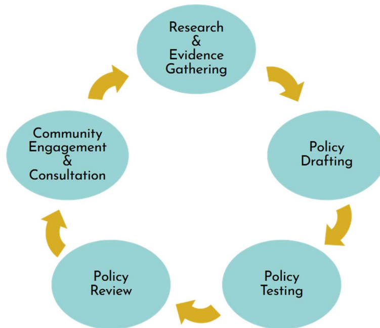
Figure 3: Plan-Making – An Iterative Process

3.13 In preparing the plan, and specifically to draft robust planning policy, members of the sub-groups followed an iterative process (illustrated in Figure 3).