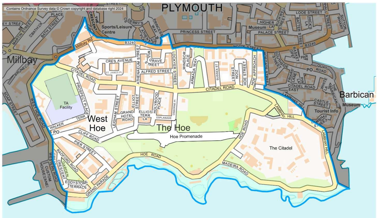
Figure 1: Hoe Neighbourhood Area Boundary